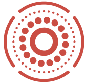
Aboriginal patient module