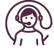
Virtual Care module