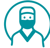
Elective surgery module